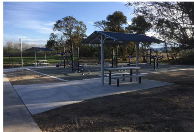
Collector Outdoor Gym right