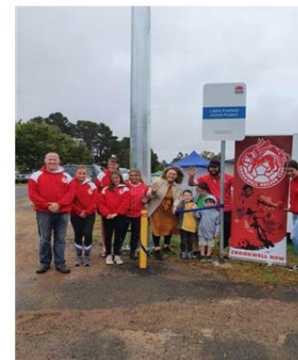
Lin Cooper Lights