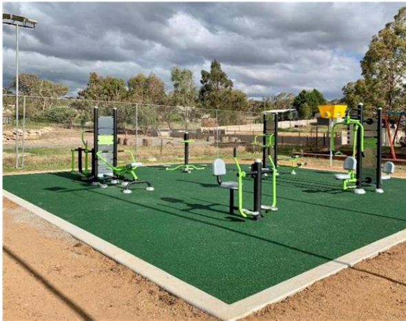
Dalton Outdoor Gym left