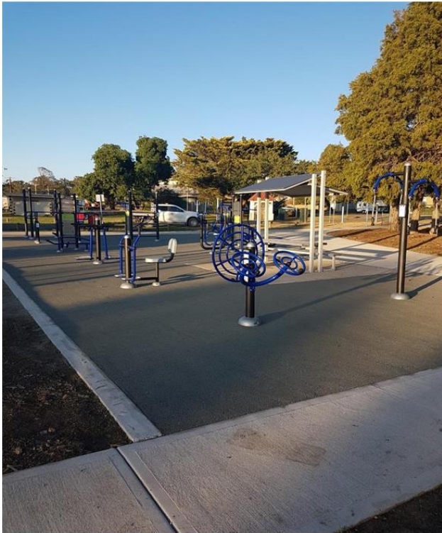
Gunning Outdoor Gym