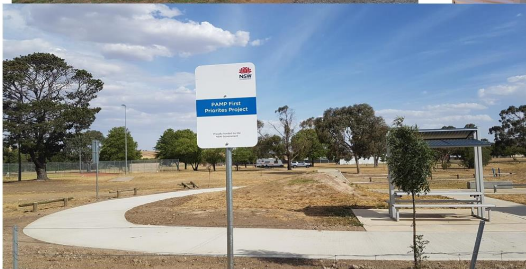
PAMP Priorities - Gunning Showground