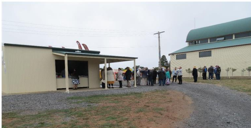
Crookwell Showgrounds Kiosk