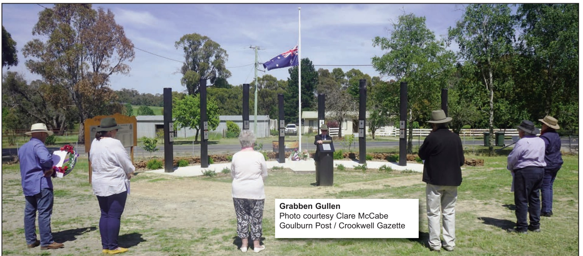
Grabben Gullen