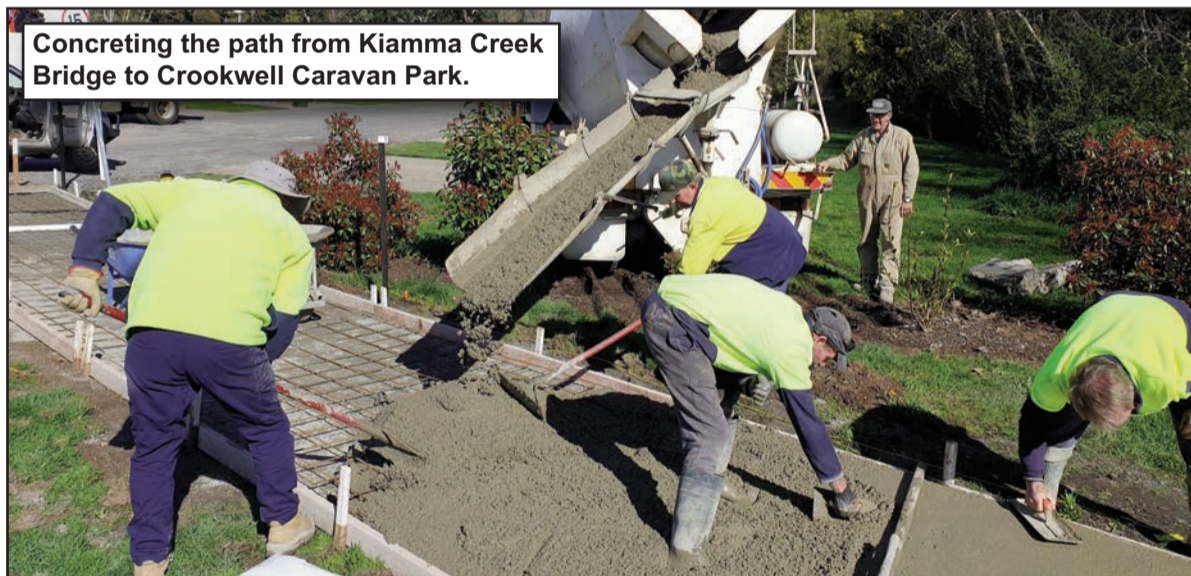
Concreting the path from Kiamma Creek Bridge to Crookwell Caravan Park.