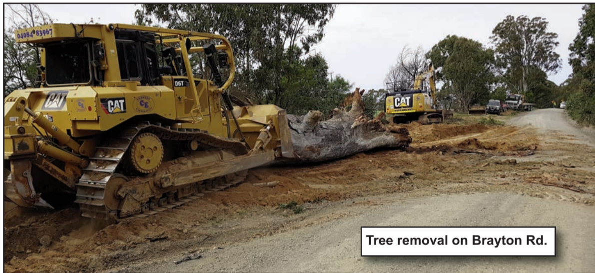
Tree removal on Brayton Rd.