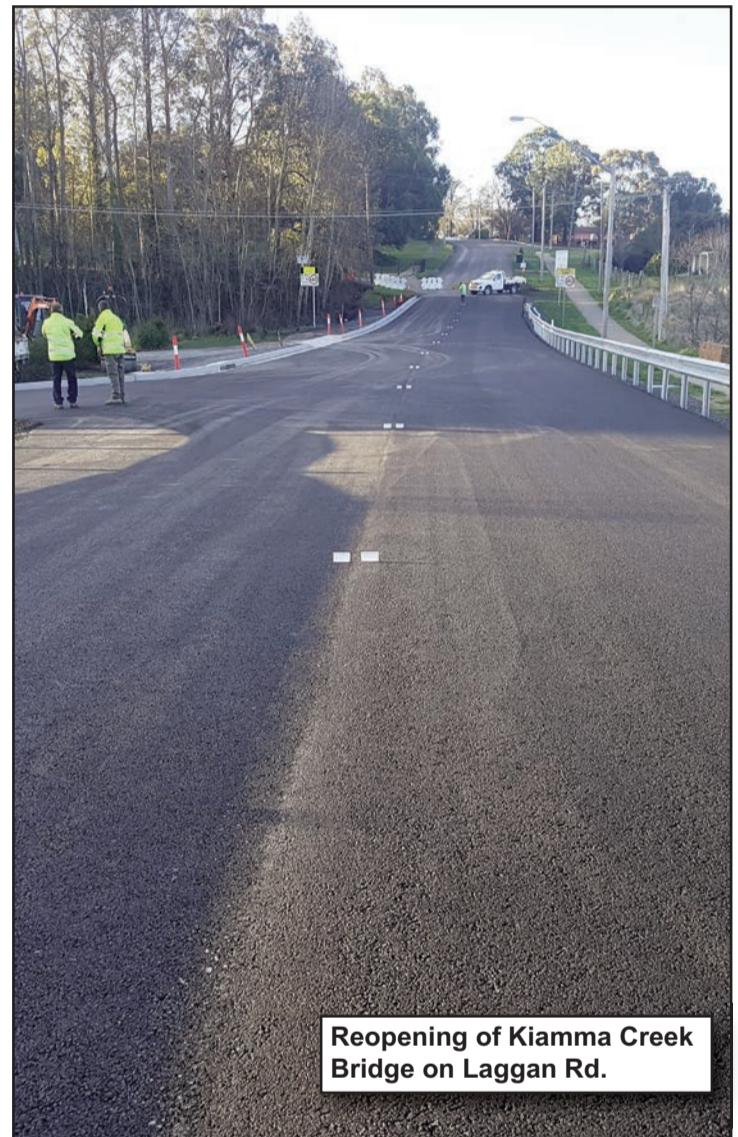
Reopening of Kiamma Creek Bridge on Laggan Rd.