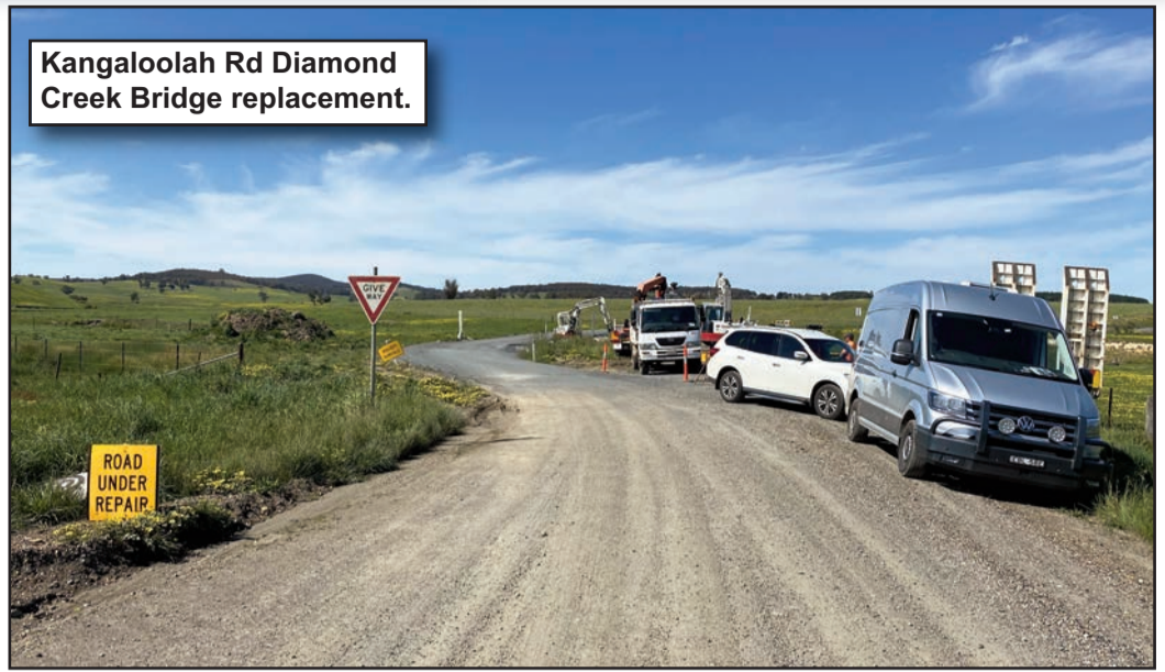
Kangaloolah Rd Diamond Creek Bridge replacement.