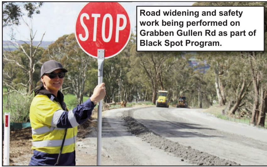
Road widening and safety work being performed on Grabben Gullen Rd as part of Black Spot Program.