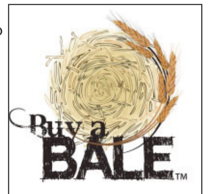
Council has donated $10,000 to the Buy a Bale campaign to assist farmers in need.

A list of helpful contacts for drought assistance and information, including mental health and financial services, is also available on Council's website: www.upperlachlan.nsw.gov.au/drought-assistance-information-and-helpful-contacts .