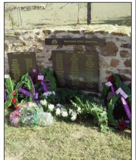
The Breadalbane Memorial Wall.