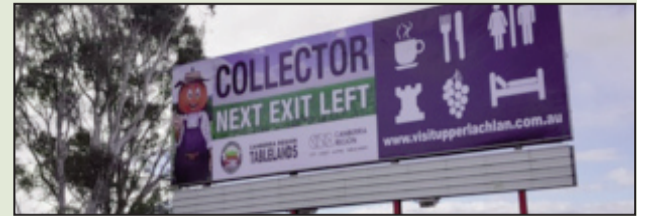
The new billboard promoting Collector. Pumpkin Festival held each May.

So that northbound travellers are reminded of the great experiences available in Collector the billboard on the Federal Highway that encourages people to turn off, has been redone in line with the new Gunning billboard on the Hume Highway. The new billboard features the welcoming face of Pumpkin Joe, the mascot of the famous Collector Village