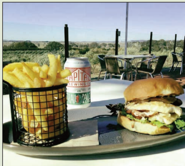
Some of the food (and views) on offer at Kiki's In the Grove.

In July, Christiane Cocum opened 'Kiki's In The Grove' a new dining experience on the grounds of Fedra Olive Grove on the Federal Highway at Collector. Christiane is showcasing food and beverage from across the Canberra region and giving travellers a gourmet alternative to stopping at the big service centres. High quality, regional food experiences are highly sought after and we expect Kiki's to become a destination dining experience for friends and family to meet up and enjoy not only great food but stunning