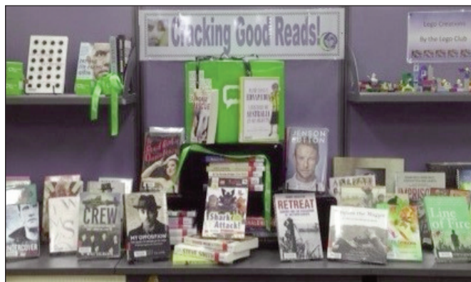
New cracking good reads on display at Crookwell Library.

Crookwell Library has a range of new book titles, replacing some of those that were lost in the February 2017 storm. Around 12,000 books valued at approximately $43,000 were damaged.