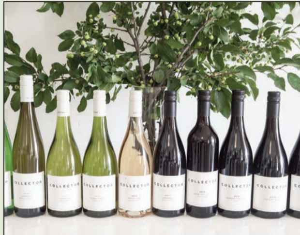
Collector Wines won Best Cellar Door in 2017 and recently took out the top prize for their Tiger Tiger Chardonnay. Crookwell Visitor Information Centre.

views across the region. In its first year of operation, Collector Wines was awarded as 2017 Best Small Cellar Door in the Canberra District by Gourmet Traveller Wine Magazine and in September this year their 2016 Tiger Tiger Chardonnay took out the top prize for best chardonnay at the National Show of Australia - Royal National Capital Agricultural Society (RNCAS) Canberra and Region Wine Show. You can purchase the 2016 Tiger Tiger at the Collector Wines Cellar Door at 7 Murray Street, Collector (open Thursday to Sunday 10.00am-4.00pm), online at www.collectorwines.com.au or at the