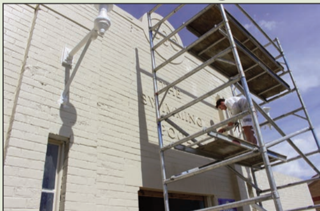
Recent painting of the façade at Crookwell Swimming Pool.

Crookwell and Gunning Swimming Pools got a facelift ahead of the start of the swimming season on Saturday, 3 November 2018.