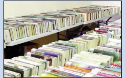
Grab a bargain and help raise funds for Crookwell Library at the Crookwell Friends of the Library Big Book Fair.