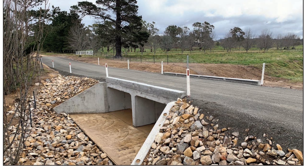
Three bridges in the Upper Lachlan Shire received a combined $1,620,845 in state government funding from the Fixing Country Bridges Program.

Deputy Premier and Minister for Regional NSW John Barilaro said round one of the program will see more than 400 ageing bridges replaced by safer, modern bridges that will better withstand events like floods and bushfires, and ease the burden of maintenance for local councils and ratepayers.