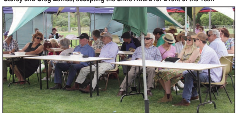
COVID-19 safety precautions moved the Crookwell Australia Day celebrations on to Memorial Oval, while in Gunning the celebrations were moved from Barbour Park to Gunning Shire Hall.