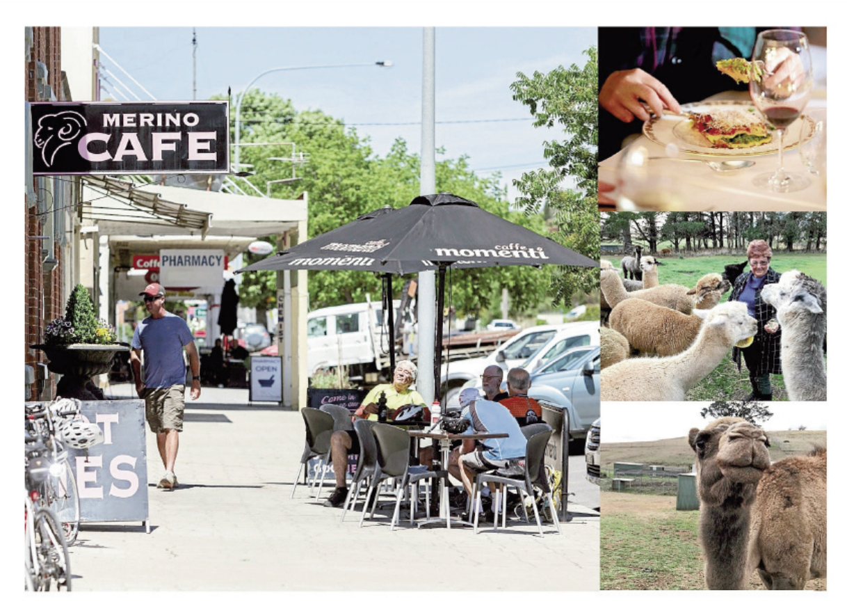
Merino Cafe, Gunning (main photo), The Argyle inn, Taraiga (top right), Greenridge Gien, Crookwell (centre right), and Taraiga Wildlife Park (bottom right).