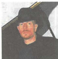
The Blinders to wail in Crookwell

The Crookwell Country Weekend is just days away, (March 11 and 12). For those who are new settlers to the area Crookwell Country Weekend is one of the highlights of this community’s calendar.