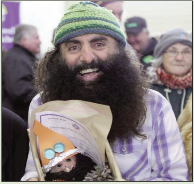
Costa Georgiadis at the 2018 Crookwell Potato Festival.

Congratulations to the organisers of the Collector Village Pumpkin Festival, staging an event for 16,000 people in a village of 300 was no mean feat. May proved to be quite a busy month for events and this year Crookwell played host to Costa Georgiadis, presenter of ABC TV's Gardening Australia and Get Grubby TV at the annual Crookwell Potato Festival. Costa was kind enough to also open the community garden and visit the public school.