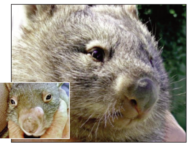
Main picture: Rosie the wombat post-surgery. Inset: Rosie before her nose job.

Should you need advice or help with injured or distressed wildlife, please ring the WIRES Rescue Number 1300 094 737. Your call will be logged and directed to the appropriate branch electronically when our volunteers will