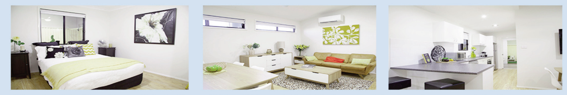
Keeping the family unit together while still maintaining each other's privacy and independence

Come and see our Granny Flat Exhibition Centres at 152 Russell Street, Emu Plains & 244 Shellharbour Road, Barrack Heights Telephone: 1300 721 150