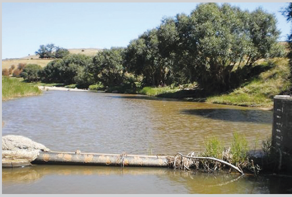
Gunning's water source the Lachlan River

urgent need of a water treatment plant. As with all small town water supplies the income received from water rates levied on the Gunning community are insufficient to fund a water treatment plant. Rates sufficiently high to fund the plant are unlikely to be affordable to the community. It has long been recognized that small communities do not have sufficient financial capacity to allow the construction of critical infrastructure such as water treatment plants, and it is for this reason that the State Government has subsidized the funding of such facilities throughout the history of country NSW. This subsidy is currently provided through the State Governments Country Towns Water Supply and Sewerage Program (CTWSSP). The CTWSSP is however, currently fully committed and the Gunning water supply is not included in that Program. Council is currently lobbying the State Government to commit further funding, and for the Gunning water supply to be included within an extended Country Towns Water Supply and Sewerage Program. Council is currently working with NSW Office of Water specialist staff to design a suitable water treatment for Gunning, so that should funding become available Council will be in a position to immediately proceed with the project.