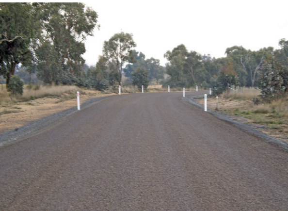
The new bitumen seal on Peelwood road

Woolshed Creek Bridge Oberon Road – MR 256: This project has been awarded and culvert construction is expected to commence on April 27, 2011 and be completed, weather permitting, by the end of June.