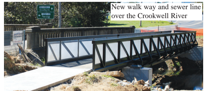
New walk way and sewer line over the Crookwell River