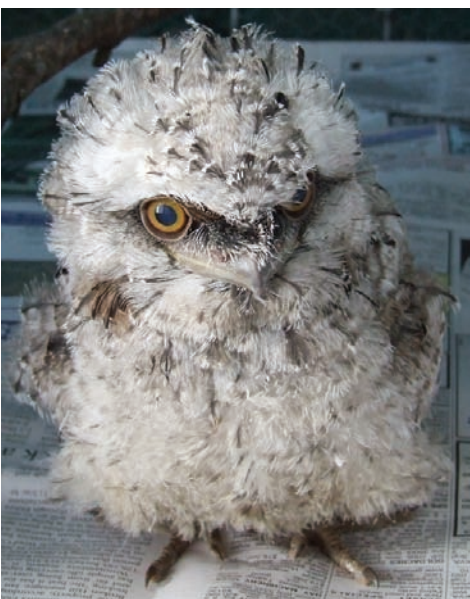
Two week old Tawny Frogmouth

WE recently received a Tawny Frogmouth into the care of Southern Tablelands WIRES. When he arrived he was a fluffy white tennis ball with some flecks of grey and a very large mouth.