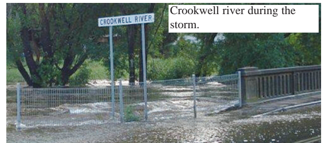
Crookwell river during the storm.