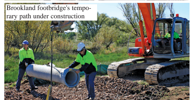
Brookland footbridge's temporary path under construction