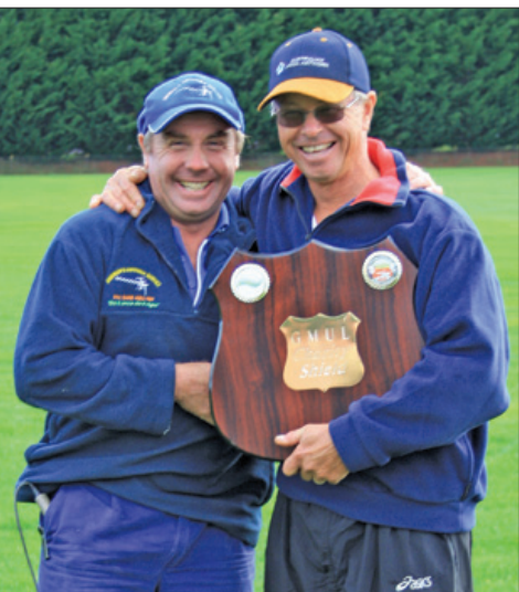
CRICKET FOR BI-PAP

AS reported on the front page of this issue of the Voice, the Goulburn Mulwaree and Upper Lachlan Councils met on the cricket pitch in a friendly contest of sporting prowess to raise funds for charity. As well as providing some cash towards the purchase of Crookwell Hospital's BI-PAP machine the contest provided a great opportunity for the two Shires to get better acquainted. To this end I can report that the game was played in good spirits with everyone having a great time. The event was such a success that further contests are being planned.