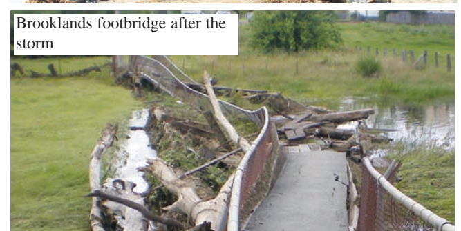
Brooklands footbridge after the storm