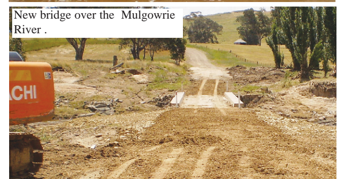
New bridge over the Mulgowrie River.