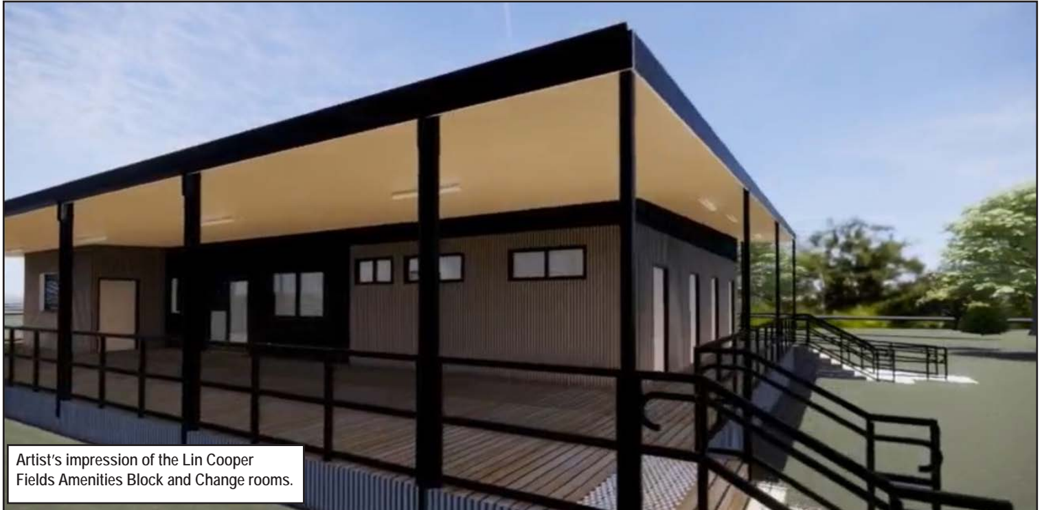
Artist's impression of the Lin Cooper Fields Amenities Block and Change rooms.

Work on the Lin Cooper Amenities block has now passed the halfway mark and is still on target for completion before the end of August 2023.