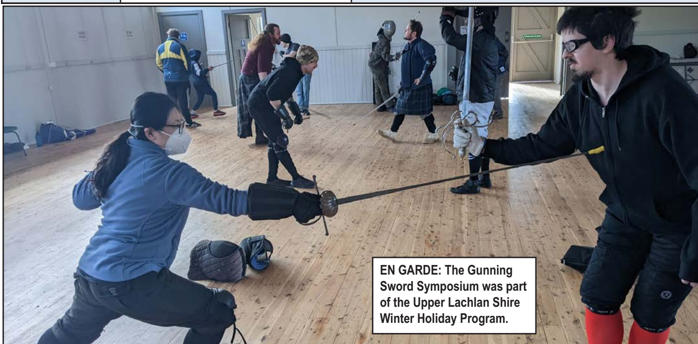
EN GARDE: The Gunning Sword Symposium was part of the Upper Lachlan Shire Winter Holiday Program.