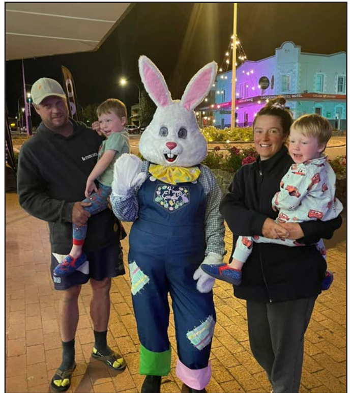
Southern Tablelands Arts, Roving performers and a fire show.

"Adults and kids joined in and it was such a fun filled afternoon of live music, arts and activities provided by