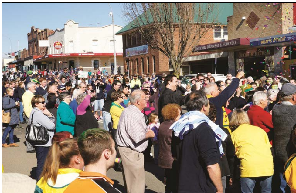
(Hockey Roo Parade 2014)