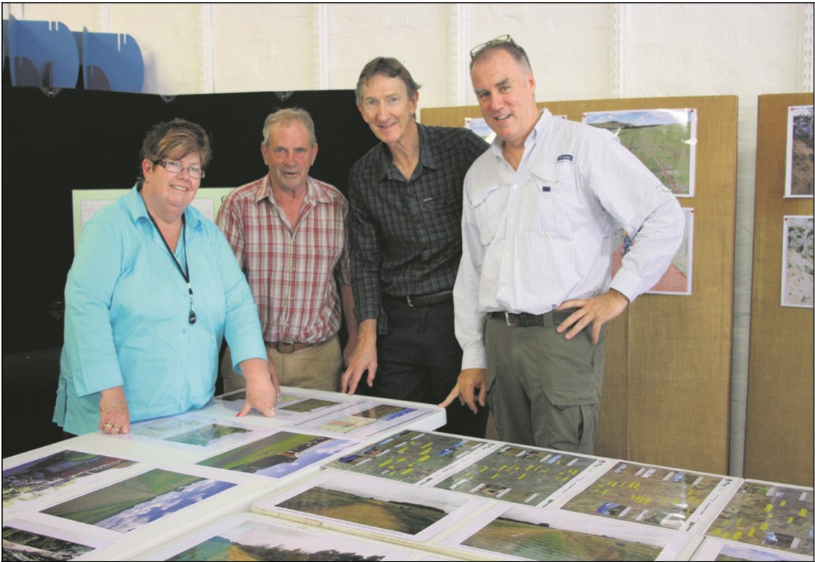
(Goulburn/Crookwell Rail Train Information Session)