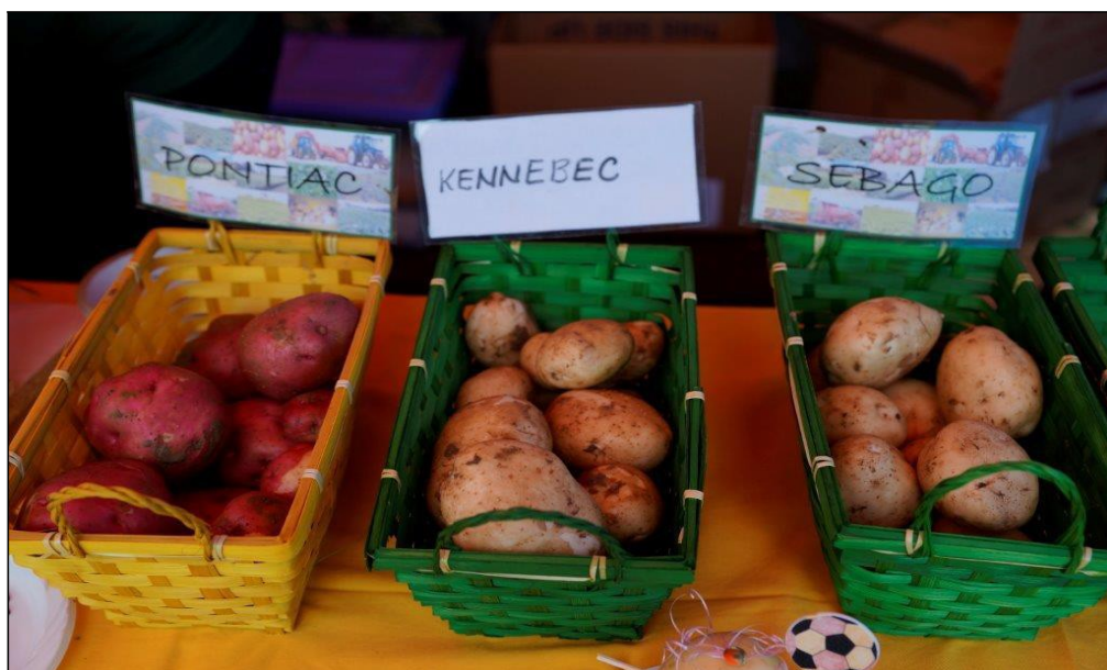
(Crookwell Potato Festival)