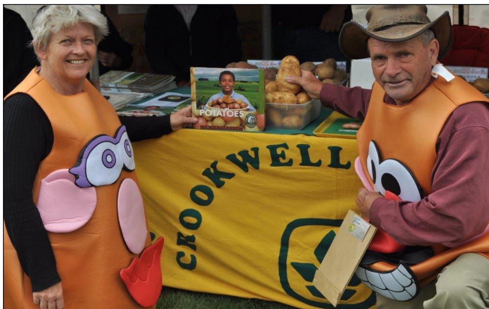
(Crookwell Potato Festival)