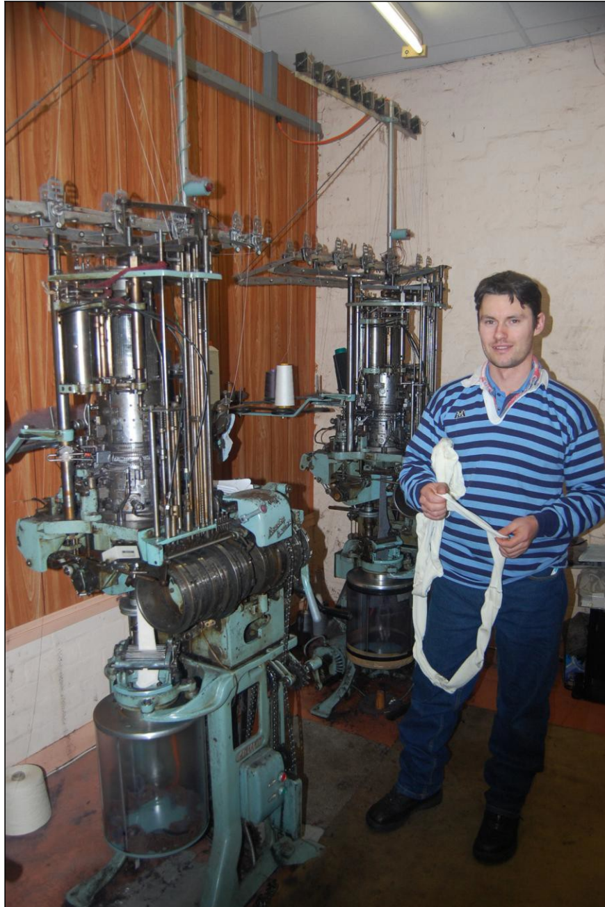
(Lindner Sock Factory – Photo provided by ULTA)