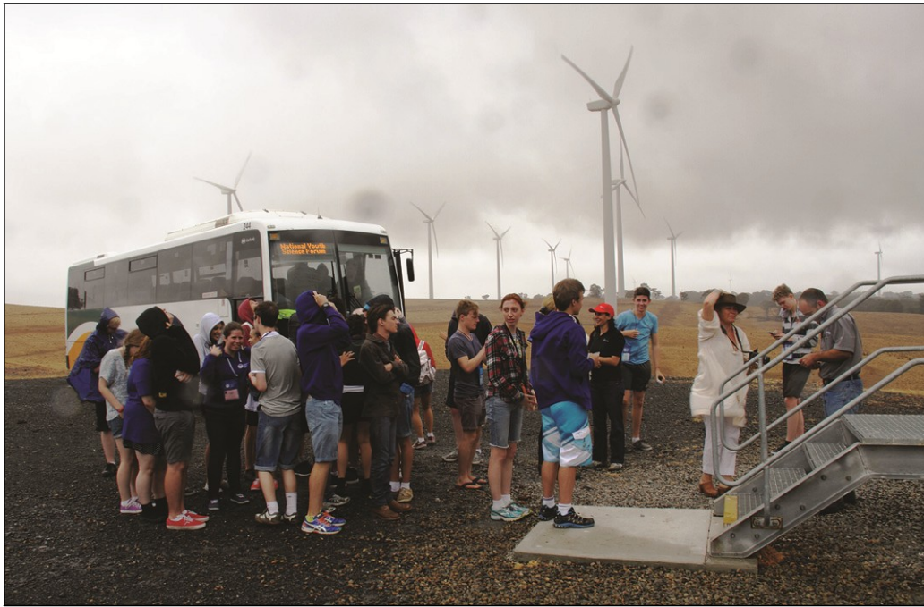
(National Youth Science Forum)